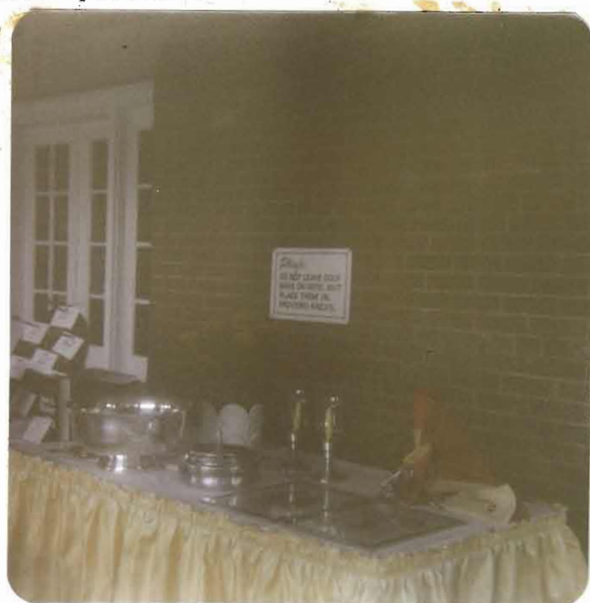
WTTG CUP Prize Table