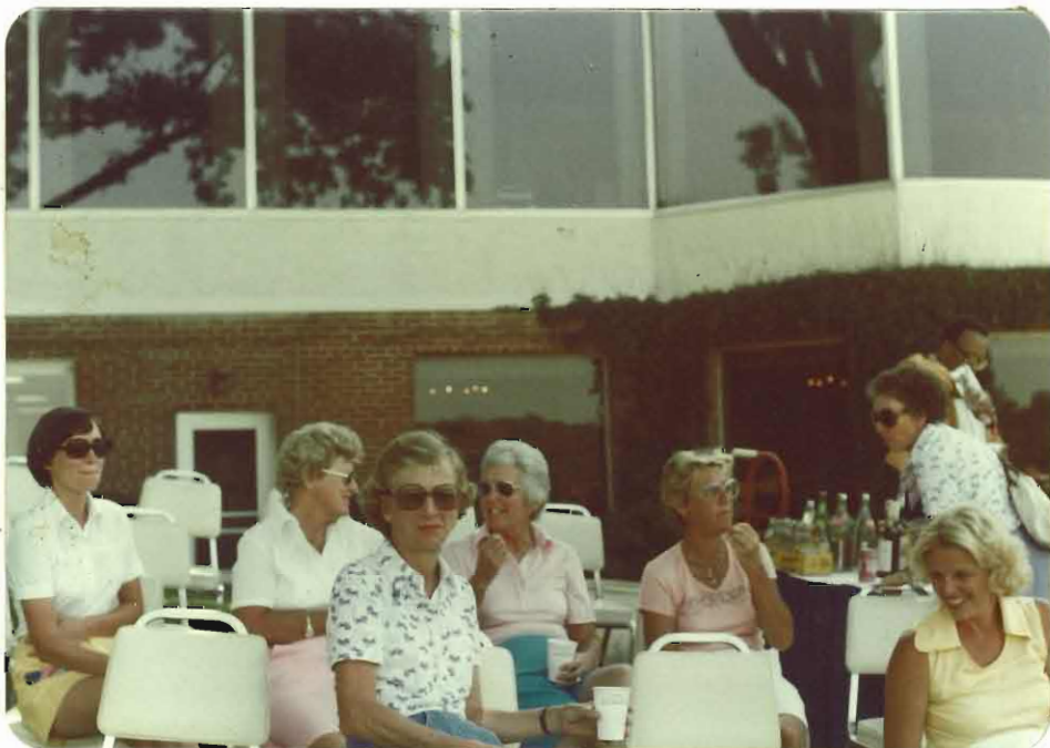
"Corby" Contestants watching the 18th Green.