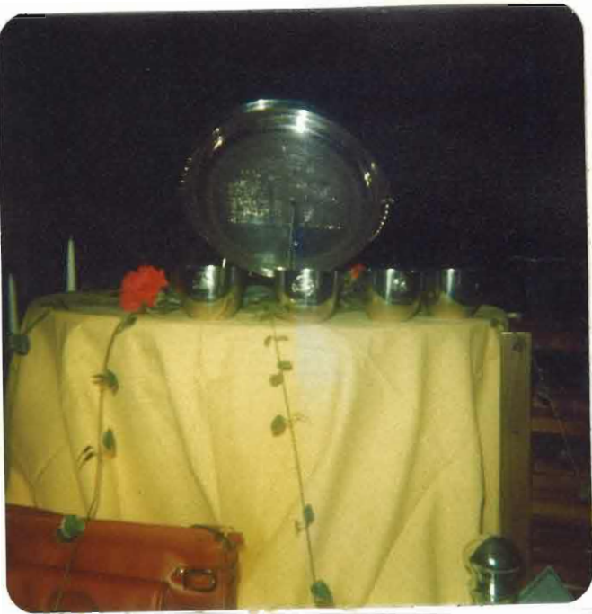
THE PRESIDENT'S PLATE