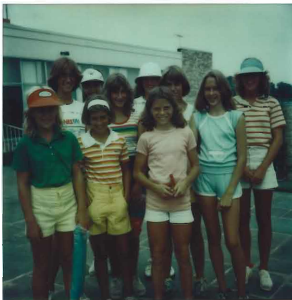
WDGA CUP - Lakewood CC - July 24, 1978 THE NINE-HOLE GROUP