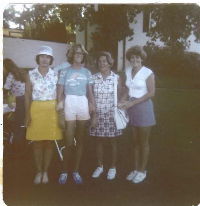
Just one of the foursomes that enjoyed the Junior-Adult